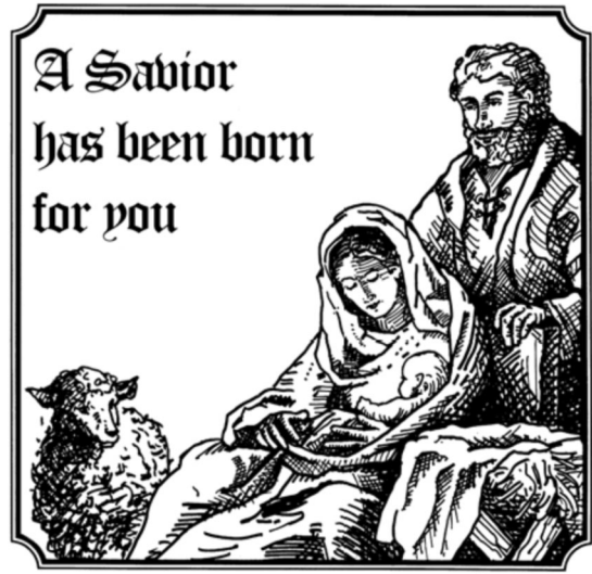
The Little Ones